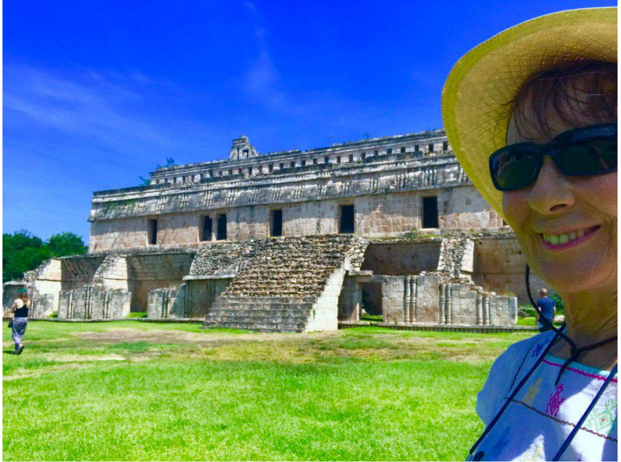
I was lucky to spend my Fall break in Mexico