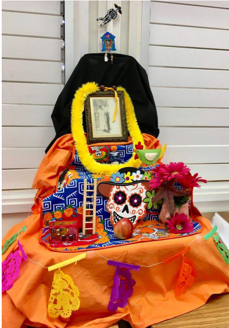
I created a Dia de los muertos altar honoring my my great-grand parents