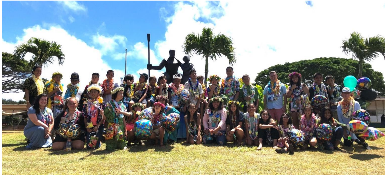
6 th Grade Promotion Ceremony, June 2020

Principal Vice Principal School Administrative Assistant Registrar Bus and Meal Clerk